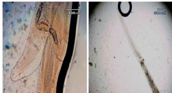
Figure 2: a. The length of the vulva flap; b. The width of the cervical papilla in adult female Haemonchus contortus worms

The Artocarpus heterophyllus leaf crude aqueous extract altered the morphometry of adult male and female Haemonchus contortus worms. Measurements included worm body length, cervical papilla width, and vulva flap length (Table 3 and Table 4).